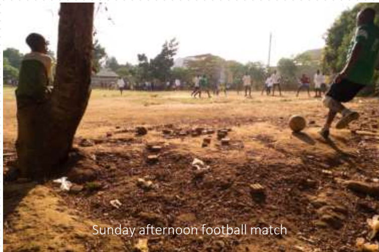
Sunday afternoon football match

The Global Health Program at the UVM College of Medicine has seen much growth in recent years having established new partnerships in existing initiatives. With the goal of improving health care and gaining experience and understanding, students are encouraged to share their stories about their visits abroad on the Global Health Diaries webpage: