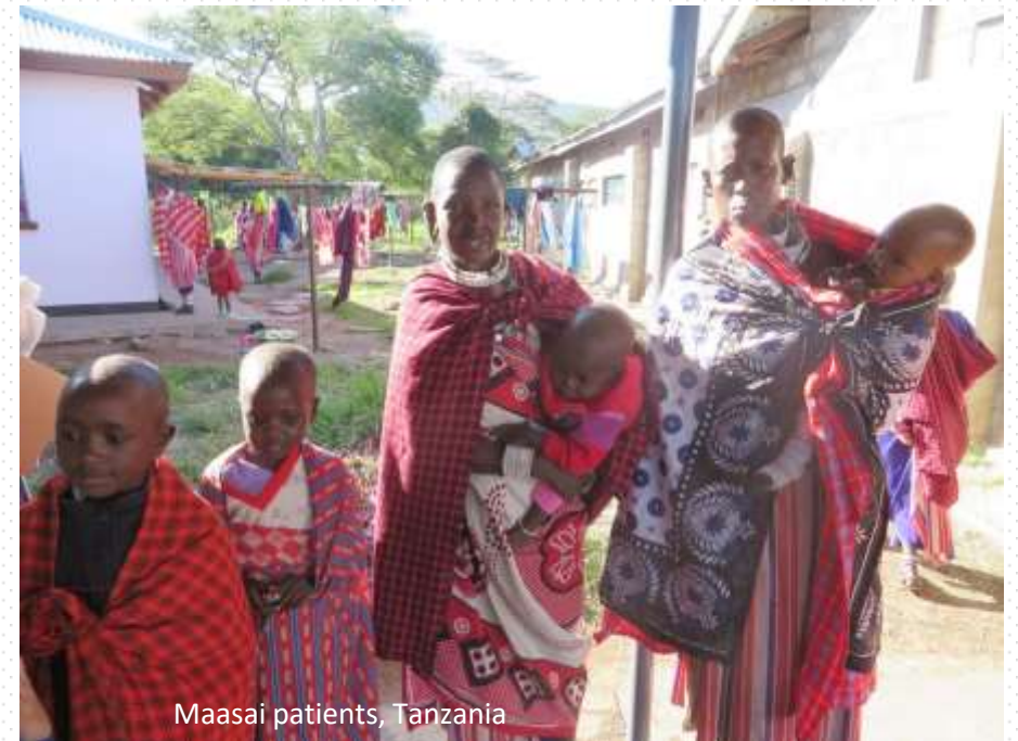
Maasai patients, Tanzania