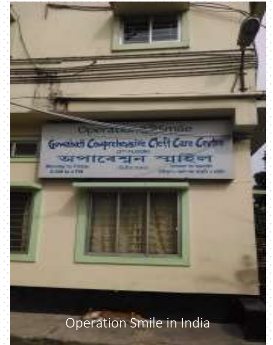
Operation Smile in India

Billy Tran '17, Update from the Field: Operation Smile , July 15, 2014