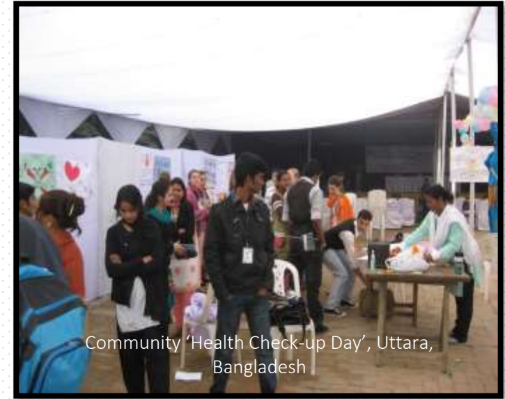
Community 'Health Check-up Day', Uttara, Bangladesh