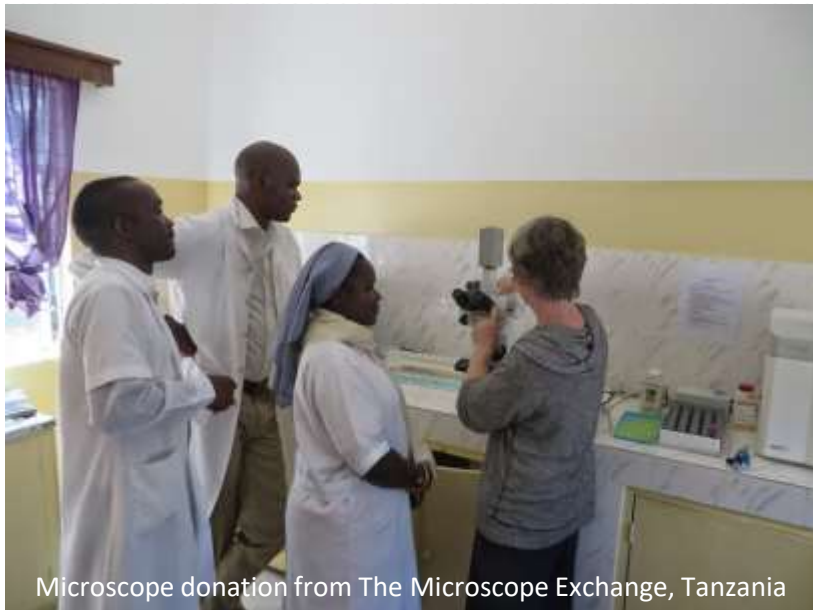
Microscope donation from The Microscope Exchange, Tanzania

Nurturing good relationships with hospitals and medical schools in Uganda and Tanzania, she promotes and teaches global women's health both in the classroom at UVM and abroad. She sees preventative women's health as being crucial to the health of people worldwide. She stresses to her students the importance of partnering with peers, teaching from experience, and using "appropriate technology" to give the best medical care they can give.