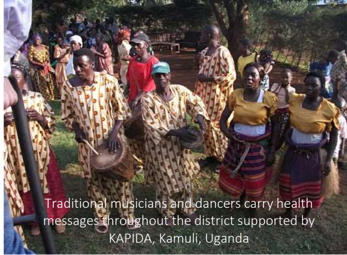
Traditional musicians and dancers carry health messages throughout the district supported by KAPIDA, Kamuli, Uganda

No matter the place, the UVM public health nursing program continues to stress the importance of communities learning to help themselves and to become sustainable. The following photographs give a glimpse into the world of public health nursing for UVM students visiting Uganda and Bangladesh.