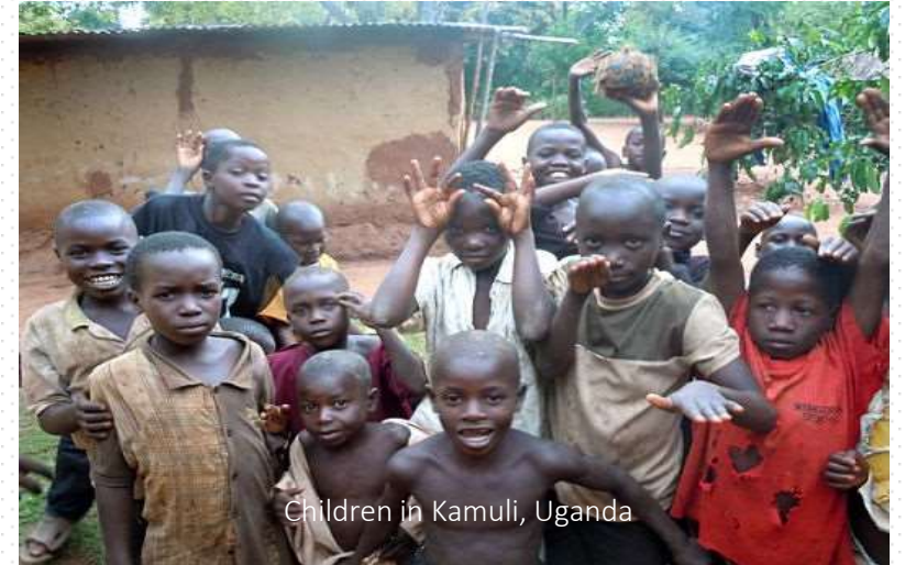
Children in Kamuli, Uganda

These students can experience a disjuncture between their values and beliefs on what is “healthy” and the cultural and social norm that they are exposed to in other countries. This experience is called ‘Cognitive Dissonance’. With the assistance of their mentors, nursing students work through these issues by keeping a journal and talking about their experiences.