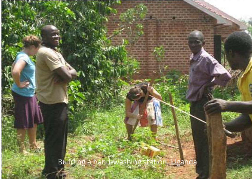
Building a hand-washing station, Uganda