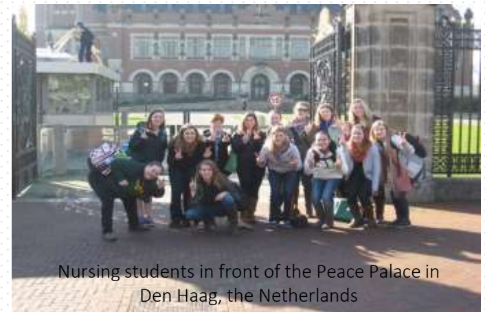
Nursing students in front of the Peace Palace in Den Haag, the Netherlands