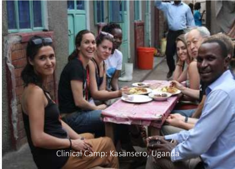
Clinical Camp: Kasansero, Uganda