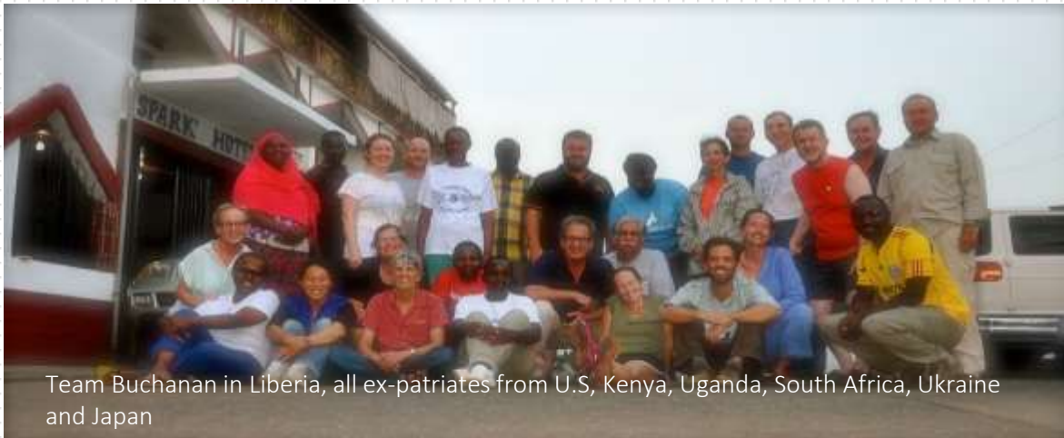
Team Buchanan in Liberia, all ex-patriates from U.S, Kenya, Uganda, South Africa, Ukraine and Japan

“My survival is contingent upon my colleague beside me, on his/her attention to detail and maintenance of protocol every minute we prepare to both enter and exit a treatment unit” (Sadigh, The Landscape of Medicine , November 13, 2014).