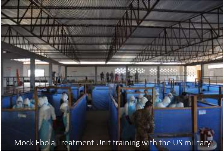
Mock Ebola Treatment Unit training with the US military