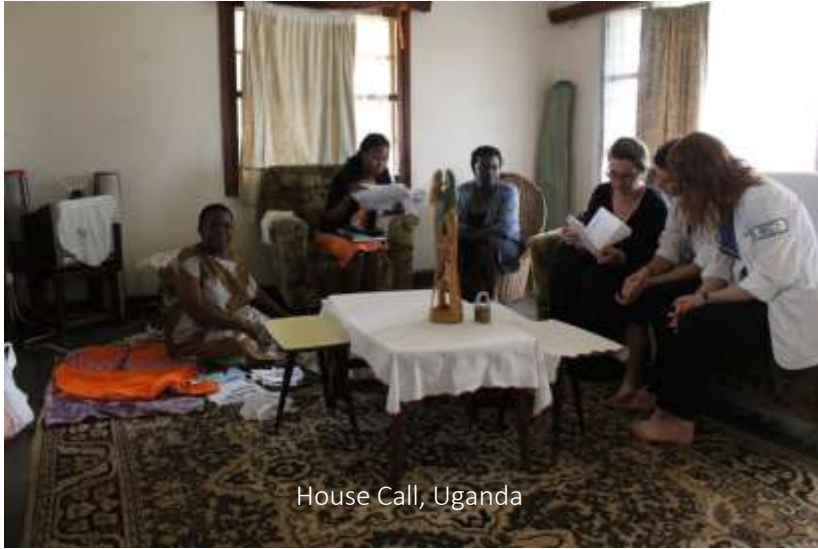
House Call, Uganda