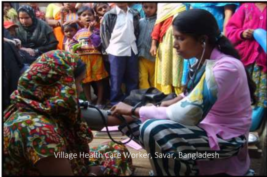
Village Health Care Worker, Savar, Bangladesh

Immersing into a new culture and assisting with health care means learning about what is needed and how to help in the new environment. This help may include: