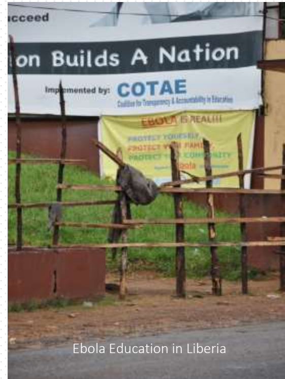
Ebola Education in Liberia