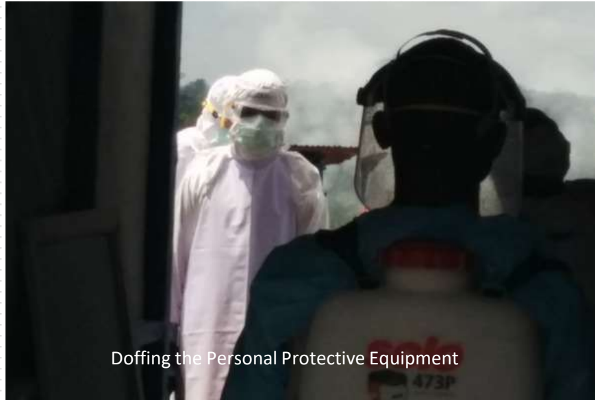
Doffing the Personal Protective Equipment