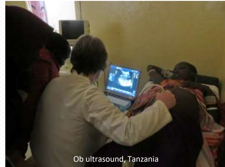
Ob ultrasound, Tanzania

Entering a medical situation in another country is about asking what is needed and collaborating with in-country partners to develop projects and programs that make sense in the local context and help reach the goals of the partner.