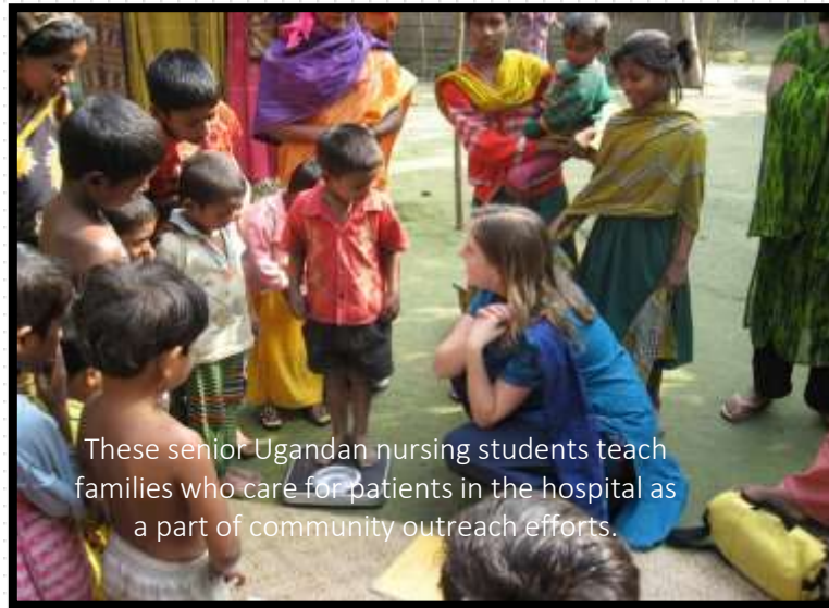
These senior Ugandan nursing students teach families who care for patients in the hospital as a part of community outreach efforts.